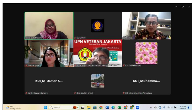
Documentation of Virtual Meeting for the German Center Programs

UPNVJ Hosted a virtual meeting to discuss the restructuring of the German Centre. Faculty representatives from various disciplines provided valuable input on the initiatives to enhance the German Centre's impact. Key ideas included hosting environmental poster competitions and exhibitions, fostering collaborative programs with German institutions, and creating opportunities for student mobility and dual-degree programs.