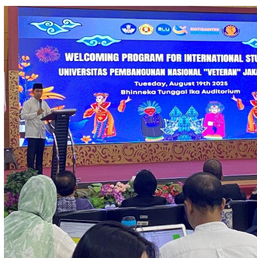
Leading prayer before event started Rectors giving a warm welcoming to all participants