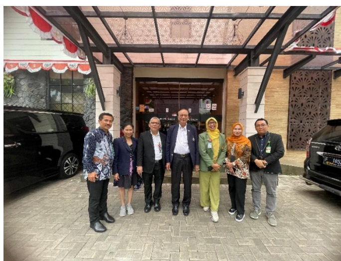
After lunch with Walailak University