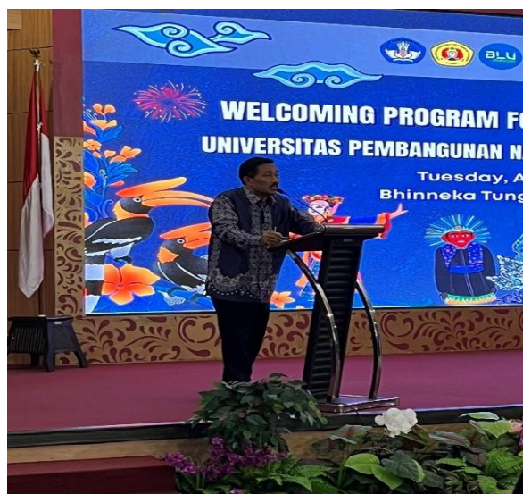
Welcoming remarks from Act Head of KUI