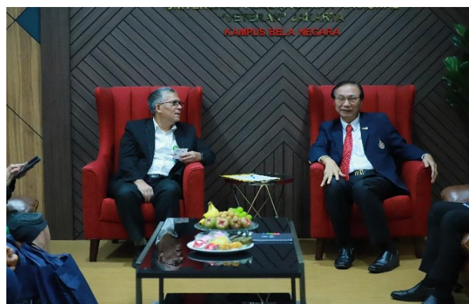
Courtesy call President of Walailak University and Rector UPNVJ