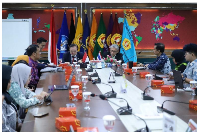
Discussion space from all dean of each faculties with the president of Walailak University