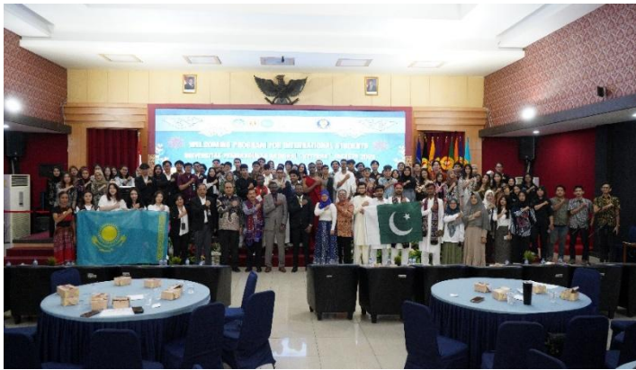
Documentation session on stage

On August 19, 2025, Universitas Pembangunan Nasional “Veteran” Jakarta (UPNVJ) warmly welcomed its new international students through the Welcoming Program for International Students 2025. The event, held at the Bhinneka Tunggal Ika Auditorium, Rectorate Building, was filled with vibrant cultural exchange, inspiring speeches, and a strong spirit of togetherness.