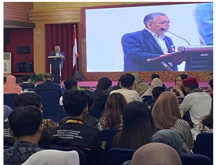
Opening remarks from UPNVJ Rector

Beyond the ceremonial aspects, the event reflected UPNVJ’s deeper mission: to ensure that every international student feels at home, supported, and inspired throughout their academic journey. It also laid the foundation for long-term collaborations with ministries, embassies, and partner universities abroad.